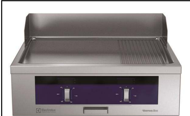
589107 (MCHOABH0AO) Electric Fry Top with smooth and ribbed chrome Plate, one-side operated with backsplash